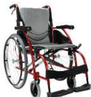
PC 115 (SP)