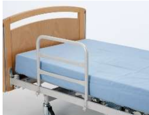
SAFETY GRAB RAIL Ref Code ISGR