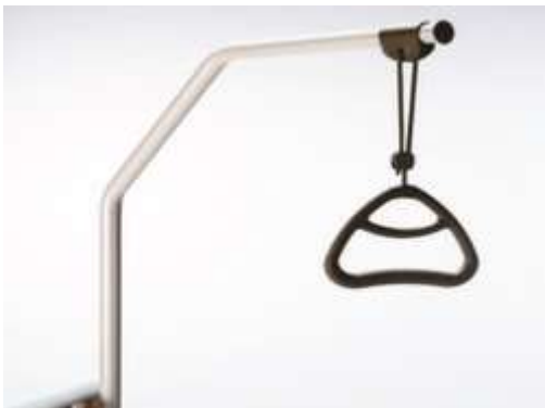
LIFTING POLE Ref Code ILP