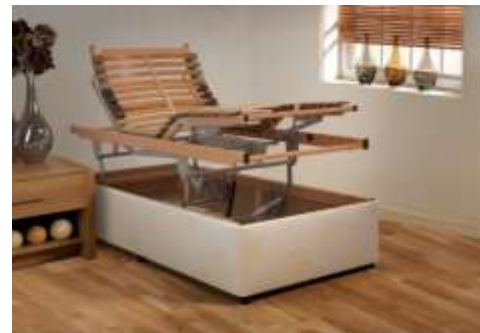
INTEGRATED MECHANISM LIFT