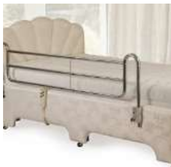
SAFETY SIDES Ref Code RRSS