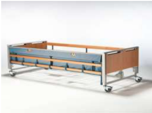
PADDED BED RAIL COVERS Ref Code IPRC