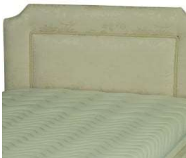
HEADBOARDS Ref Code RRHB1