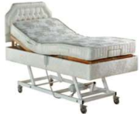
EXTERNAL MECHANISM LIFT