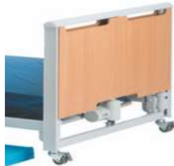
WOOD PANEL BED ENDS Ref Code IWPE