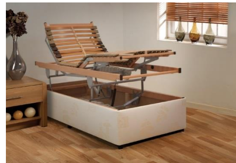
INTEGRATED MECHANISM LIFT