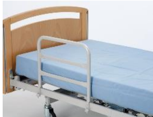
SAFETY GRAB RAIL Ref Code ISGR