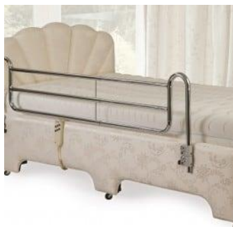
SAFETY SIDES Ref Code RRSS