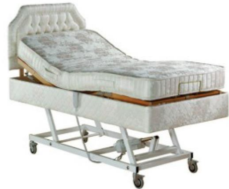
EXTERNAL MECHANISM LIFT