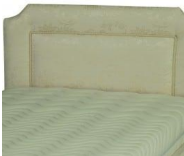
HEADBOARDS Ref Code RRHB1