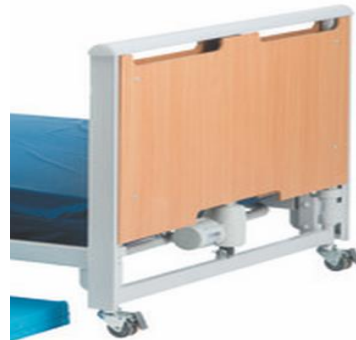
WOOD PANEL BED ENDS Ref Code IWPE