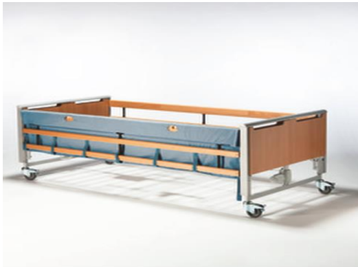
PADDED BED RAIL COVERS Ref Code IPRC