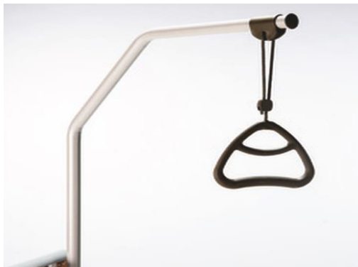
LIFTING POLE Ref Code ILP